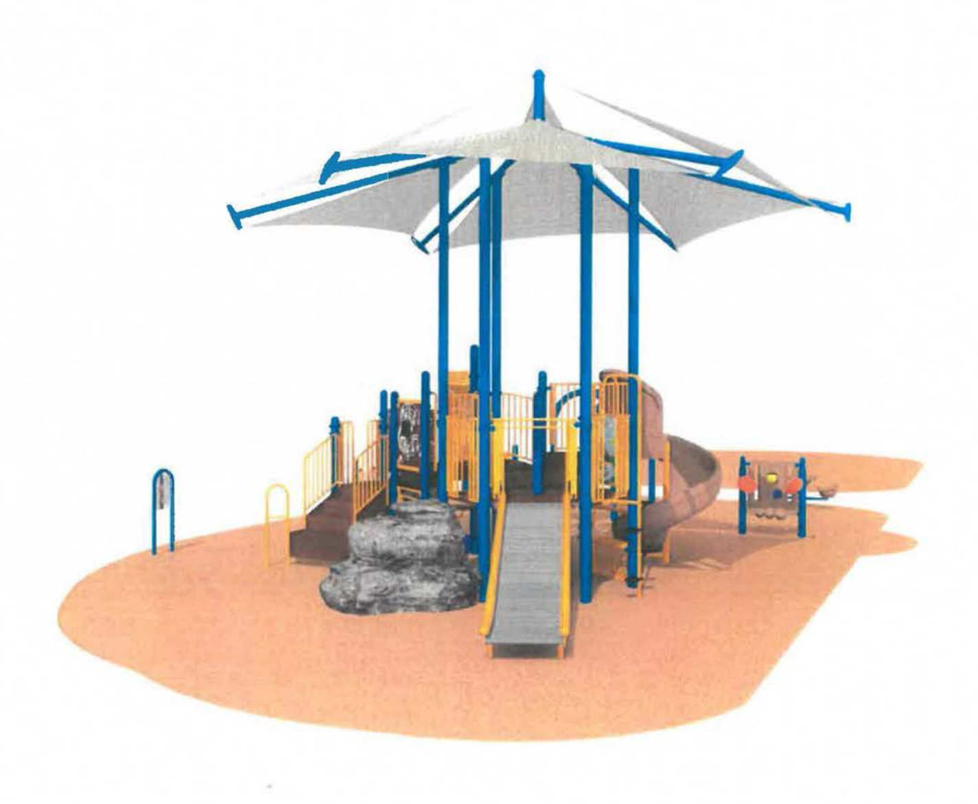
Exhibit A Schematic or rendering of Improvements