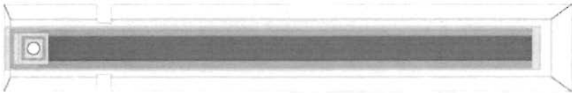
D PLAN scale: 1/8" = 1'-0"