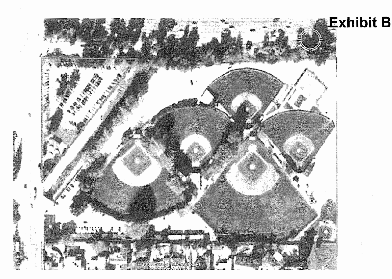
ENCINO PARK AND RIDE 5174 n. Hayvenhurst Avenue, Encino (Identified In Red, adjacent to Libbit Park Baseball Fields)