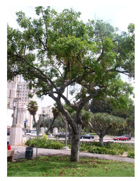
Mac Arthur Park 2230 W. 6th St Los Angeles, CA 90057